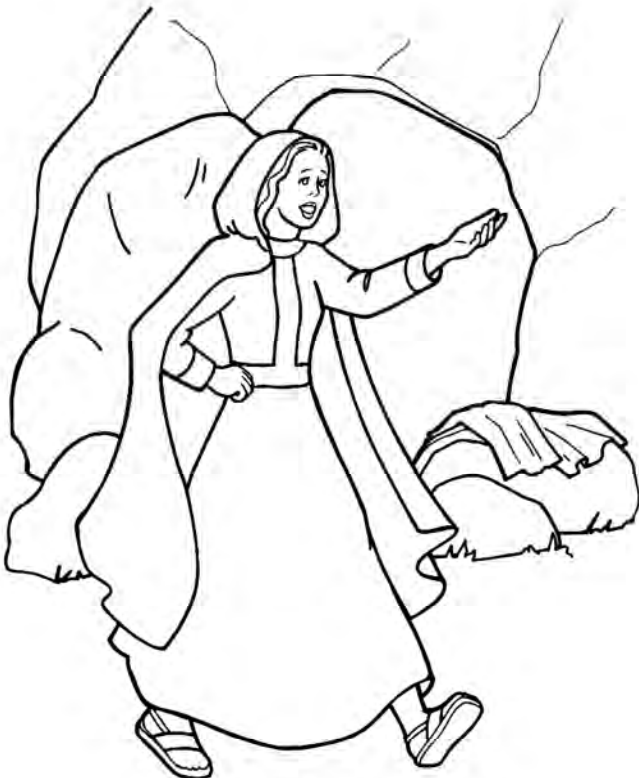
"They have taken the Lord from the tomb." John 20:2