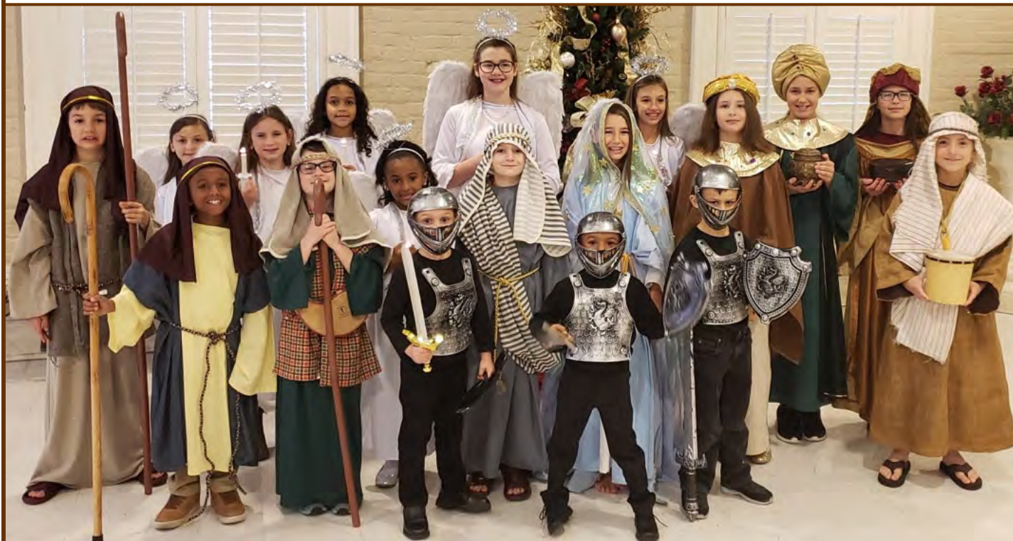
The children pictured above reenacted the Nativity during 4pm Mass on Christmas Eve. Their presence at the Children's Mass brought the first Christmas to life.