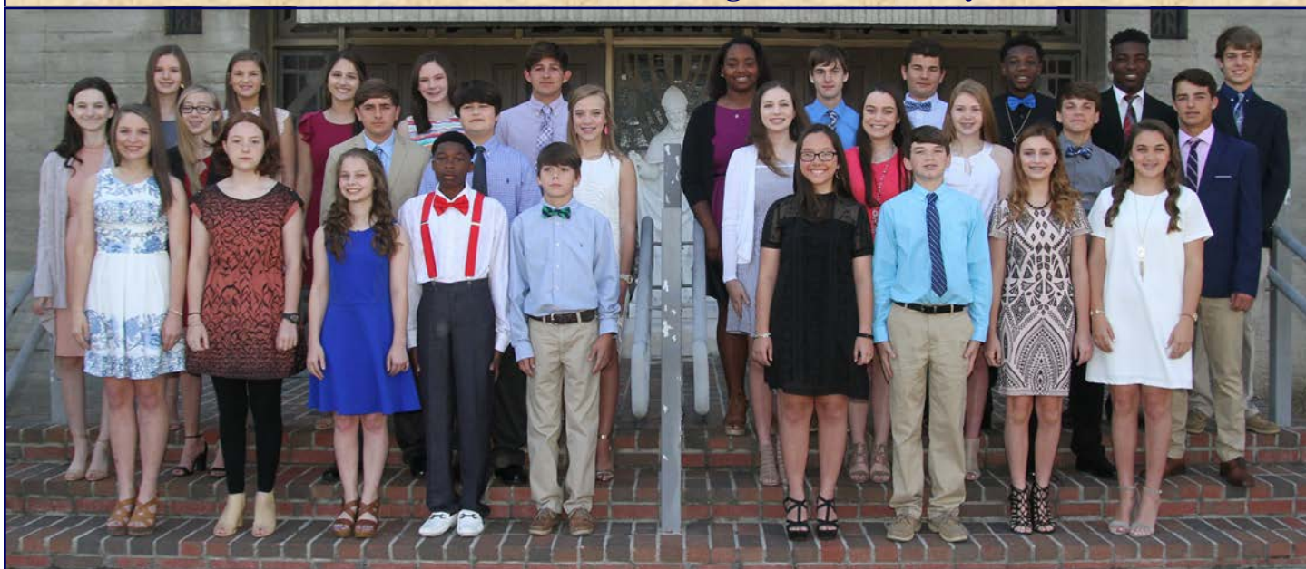
St. John 8th graders are pictured at their recent Crossing Over Ceremony. The ceremony, which was held on May 3, at St. Clement Church, ushers in their high school years.